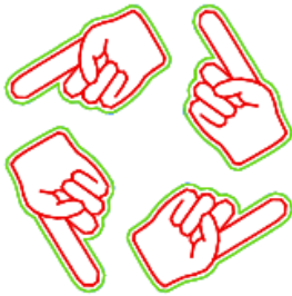
Foamfinger 45mm Sorted.pes 80.20x80.20 mm; 2,596 stitches 3 thread changes; 3 colors